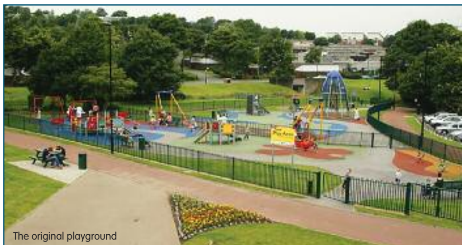
The original playground